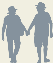
TERM & WHOLE LIFE

Whole life insurance offers permanent coverage that stays the same throughout the life of the policy. It can help your loved ones pay for medical bills and funeral costs.